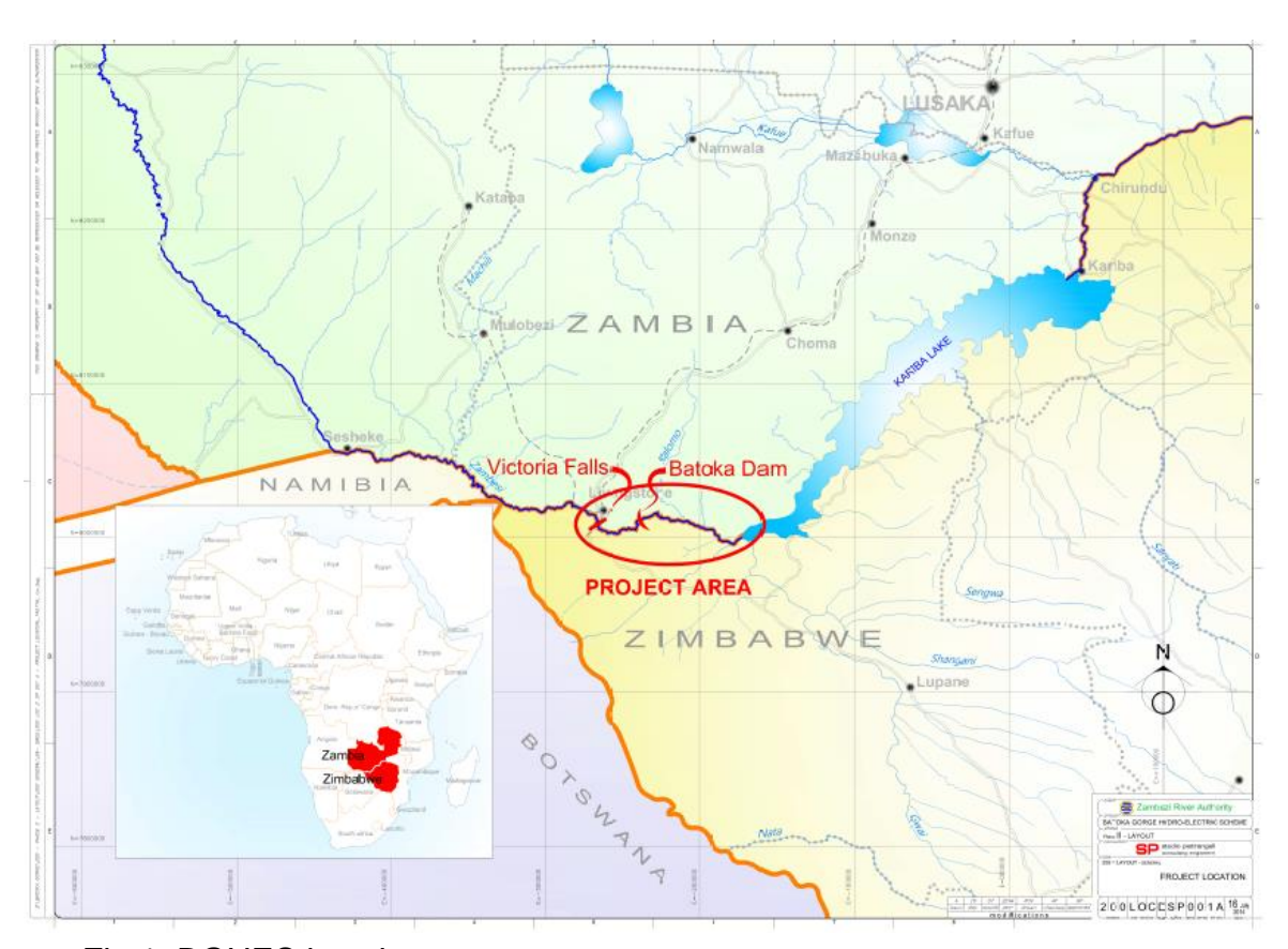
Fig 1: BGHES location

The Zambezi River Authority (The Authority), a bilateral organisation owned by the Republics of Zambia and Zimbabwe and mandated to operate, monitor and maintain the Kariba Dam Complex as well as exploit the full potential of the shared portion of Zambezi River located along the common border between the two Countries is undertaking the development of the Batoka Gorge Hydro Electric Scheme (BGHES), 47 Km downstream of the Victoria Falls, along the Zambezi River.